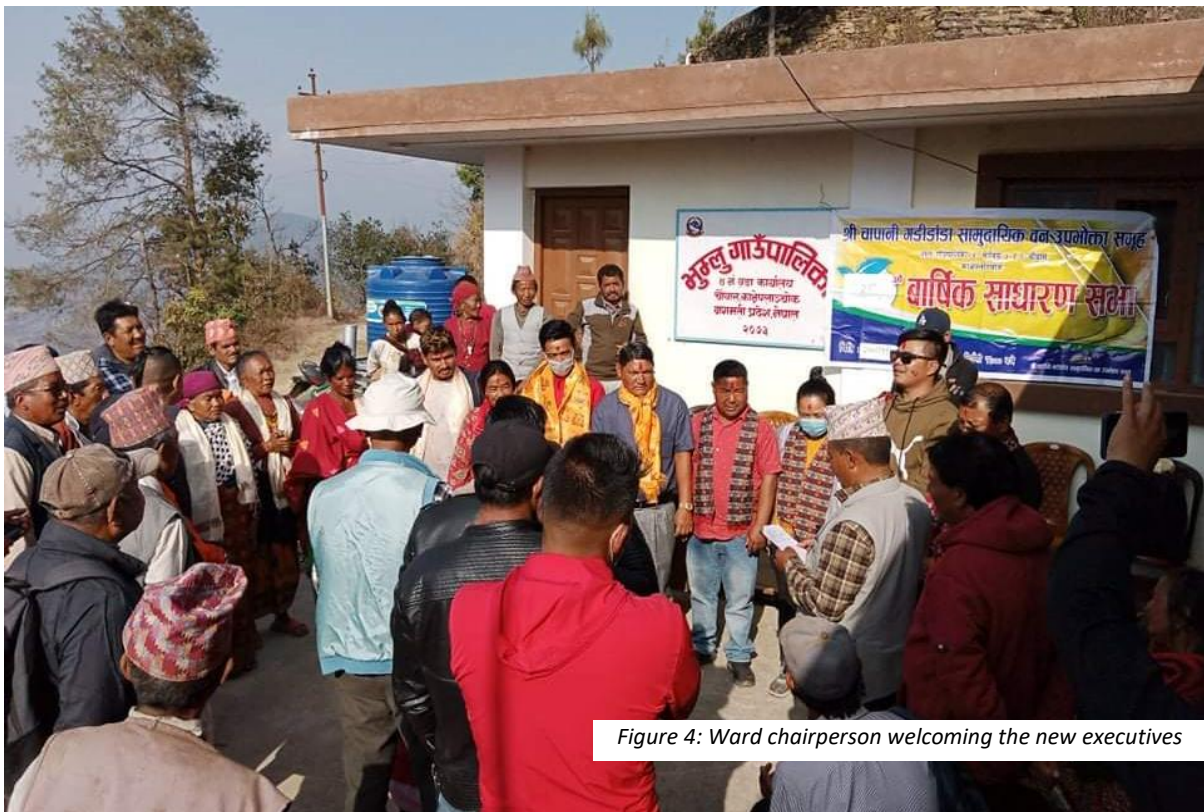
Figure 4: Ward chairperson welcoming the new executives

He said- " You have proposed an 11-membered committee, of which 50% means 5.5. It doesn't matter if one less woman representative is on the committee. It means that out of 11, 5 women representatives would be fine. "