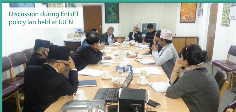
Discussion during EnLiFT policy lab held at IUCN

We organized 12 EnLiFT Policy Labs (EPL) which we define as a researcher convened forum of policy actors confronting a specific policy challenge, designed to foster meaningful dialogue between researchers and policy actors in developing a shared understanding of the policy problem and the possible solutions informed by research evidence 1 . The EPL bridges research and policy domain and forges effective dialogue between the two.