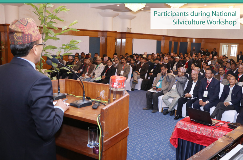
Participants during National Silviculture Workshop

i) National Silviculture Workshop (19-22 Feb, 2017); ii) National Workshop on Land Management and Food Security: Addressing Under-utilised Agricultural Land Issues in Nepal (28th -29th April, 2016). Besides, we organized several workshops at district level in our research sites (e.g. forest based enterprises, CF-LG relations).