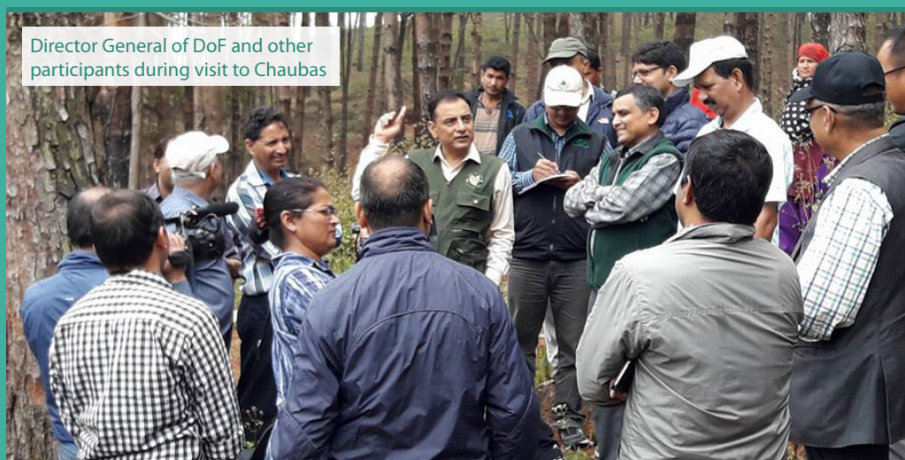
Director General of DoF and other participants during visit to Chaubas

EnLiFT researchers made several formal and informal meetings with relevant officials as a part of policy discussion and have communicated their research generated knowledge. While such engagements are crucial in maintaining mutual trust, identifying and measuring actual output of such engagement is quite challenging.